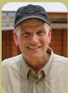
Franklin Graham President, Samaritan's Purse